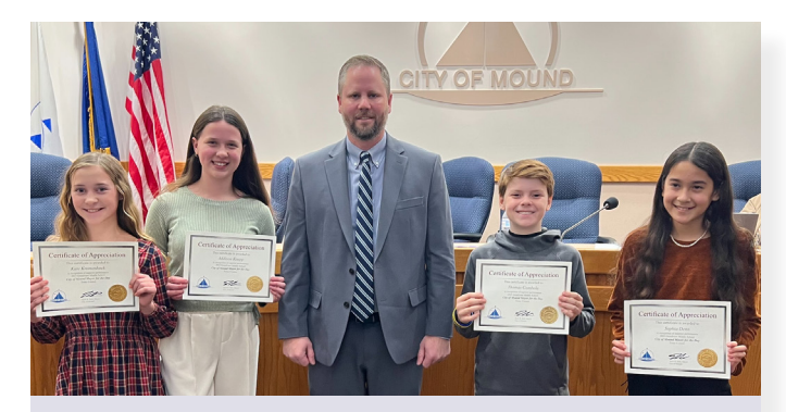
Mayor for A Day

At the November 28th, 2023 City Council meeting, five Grandview Middle School sixth graders presented their short essays titled "Mayor for a Day". The students were tasked with explaining what they would do if they were the mayor for a day. The students did a wonderful job presenting their ideas to the City Council which included recommendations like adding more stop signs for safety, adding more green spaces, updating parks, repairing roads and more.