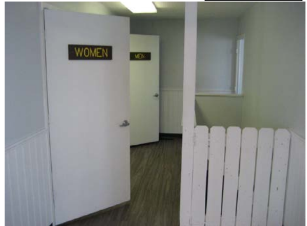
Hall, Stairs, and Restrooms