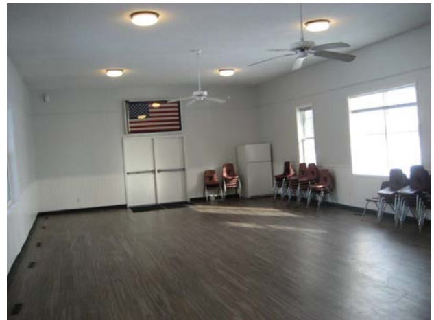
View from Kitchen to end of Main room