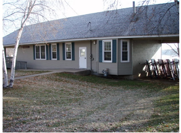
Street view toward Parking lot