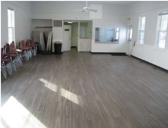
View toward Kitchen of Main room