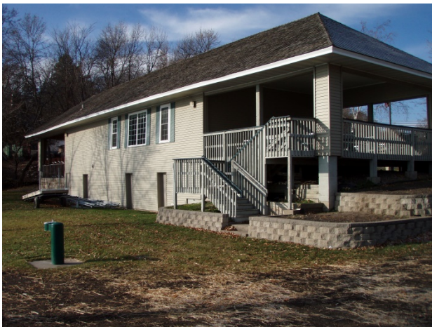
View from Lake side