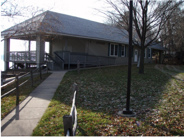
View from Parking lot