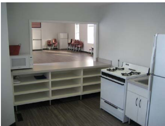
View of Kitchen toward Main room