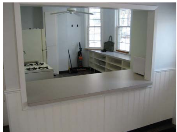
View of Kitchen from Main room