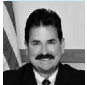
Mayor Ray Salazar