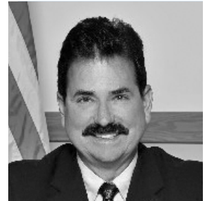
Mayor Ray Salazar