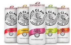
White Claw 12 cans $15.99