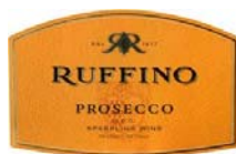
Ruffino Prosecco $13.99