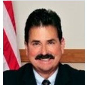
Mayor Ray Salazar