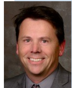
Mayor Mark Wegscheid