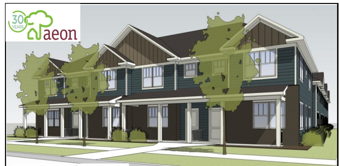
Townhomes along Balsam Lane

Aeon, a leading non-profit developer, owner and manager of high-quality affordable apartments and townhomes, serves more than 4,500 people in the Twin Cities area. Aeon recently assumed ownership of the Indian Knoll Manor Apartments. For 30 years, Aeon has been committed to helping people create a home in a safe, secure environment and connect to the community around them.