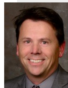
Mayor Mark Wegscheid